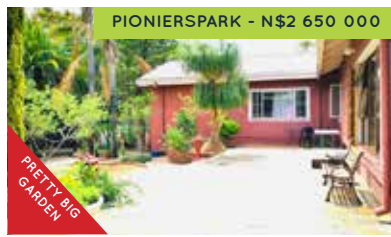
PIONIERSPARK - N$2 650 000