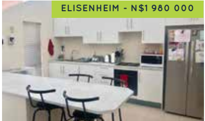
ELISENHEIM - N$1 980 000