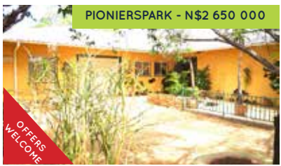
PIONIERSPARK - N$2 650 000