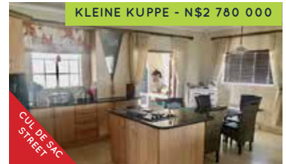
KLEINE KUPPE - N$2 780 000