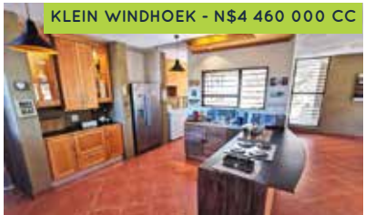
KLEIN WINDHOEK - N$4 460 000 CC