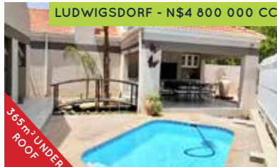
LUDWIGSDORF - N$4 800 000 CC