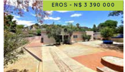
EROS - N$ 3 390 000