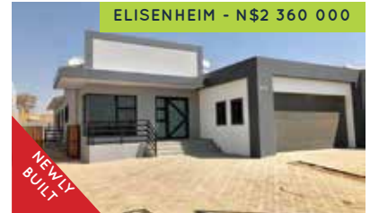
ELISENHEIM - N$2 360 000