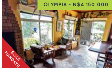
OLYMPIA - N$4 150 000