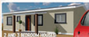
2 AND 3 BEDROOM HOUSES