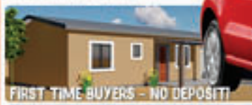
FIRST TIME BUYERS - NO DEPOSIT!