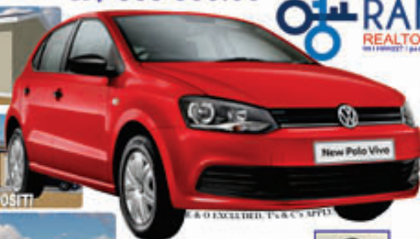
New Polo Vivo