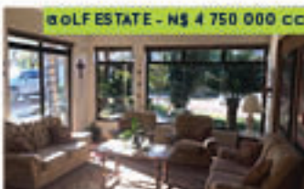
OLF ESTATE - N$ 4 750 000 cc