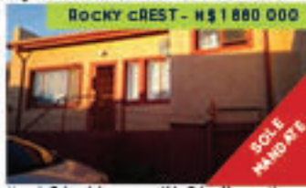
ROCKY CREST - N$ 1 880 000