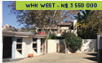
WHK WEST - N$ 3 550 000