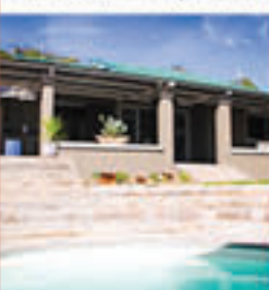
EROSPARK N$ 5.2 MIL

Beautiful new build house with 4 beds, 4 baths, o/p lounge/dining area. Massive sleep, garden, heated pool, large kitchen, party & scullery. Study, hobby/play room, laundry, outside toilet, dbl garage, dbl carport, SQ's & lots of security features. Also available to let for N$ 28 000 p.m.