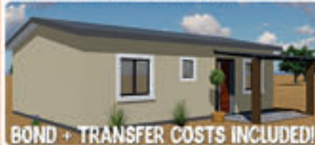
BOND + TRANSFER COSTS INCLUDED!