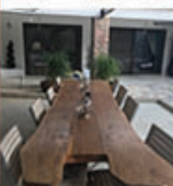
EROS N$ 4.350 MIL

One bed in popular security complex. Very modern townhouse 3 Bed, 2 bath house with o/p kitchen/living/dining area. Kitchens lead to an outdoor area. BBQ (enclosed) for maintenance. Alcon on 1st garage, three cars. Excellent BBQ's & services. A real gem!