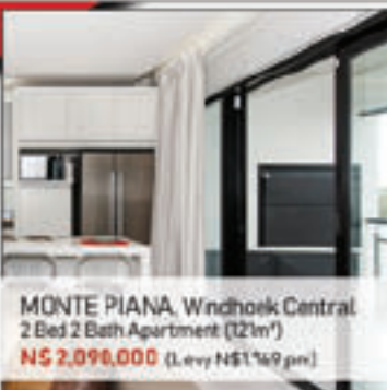
MONTE PIANA, Windhoek Central 2 Bed 2 Bath Apartment (121m 2 ) N$ 2,098,000 (Levy N$1,619 pm)

Contemporary and stylish apartment in the heart of Klein Windhoek, offering: