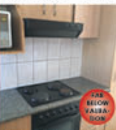
ROCKY CREST N$ 1 MIL

Bella Rosa Cellars. Renovated townhouse with 2 beds, (1 with alcon), full bath, o/p kitchen/living area. Large interlocked yard. Corner unit. Shade-net for 1 car & extra parking for one more car. All COSTS INCL. THIS IS A BARGAIN! OF THE YEAR! 1 Sept 2018.