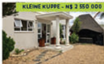
KLEINE KUPPE - N$ 2 550 000

www.facebook.com/RightmoveProperties www.rightmoveproperties.com.na