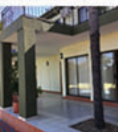
LUDWIGSDORF N$ 8.8 MIL

Double story house with a magnificent view - 1433 m 2 erf, entrance hall, o/p lounge/kitchen/living room, study, scullery/laundry, 4 beds, 2 full baths (1 is en-suite) & guest toilet. Flat, 2 dbl outdoor gasgrills, logs BBQ, pool, patios & balconies. Also available to let for N$ 28 000 p.m.