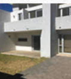
KLEINE KUPPE N$ 2.450 MIL

Guldas 101 - Near one-ele. Modern, light & bright. Duplex townhouse with dbl garage, o/p kitchen/living/dining room, guest toilet, patio & BBQ. 3 Beds (with balconies), 2 baths, north-facing & 1 of the largest gardens. Pet friendly. INCLUDES TRANSFER FEES. Don't miss out on this one!