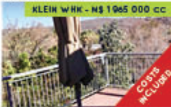
KLEIN WHK - N$ 1 965 000 cc