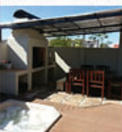
P. PARK EXT 1 N$ 2.050 MIL

Westvale Complex close to BRAM. Townhouse - 2 beds, 2 baths, o/p kitchen/dining/living area, scullery, dbl garage, shaded carport, small backyard, Jacuzzi, pergola, BBQ & water cooler. All rooms with alcon. Large communal park. PET FRIENDLY!