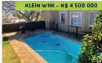
KLEIN WHK - N$ 4 500 000