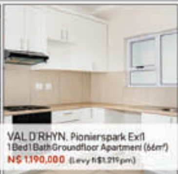
VAL D'RHYN, Pionierspark Ex1 1 Bed 1 Bath Groundfloor Apartment (66m 2 ) N$ 1,190,000 (Levy N$1,219 pm)

Conveniently close to Windhoek's central business district (CBD) and walking distance to the Village Office Park. Only 5 min drive to St Georges Private School and Windhoek High School, and 10 min to Maruba Mall.