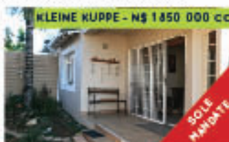
KLEINE KUPPE - N$ 1 850 000 cc