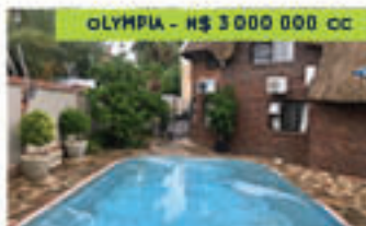
OLYMPIA - N$ 3 000 000 cc