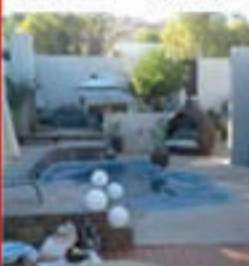
EROSPARK N$ 4.8 MIL

House consists of 3 beds, 2 full baths (1 en-suite). O/p kitchen/dining room, scullery/huge lounge, fireplace, heated pool, BBQ, enl. room & Jacuzzi. 1 lounge outside room/office, ideal for work from home. SQ's, carport for 2 cars. Also available to let for N$ 21 000 p.m.