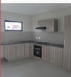
EISENHEIM N$ 1.050 MIL

Spacious 2 Bedroom flat on 2nd floor. Open plan kitchen with living/dining area that leads out to a balcony. Parking for 2 cars. PRICE DRASTICALLY BROFFEN! Insulin, Insulin! Insulin in place. This is for the investor.