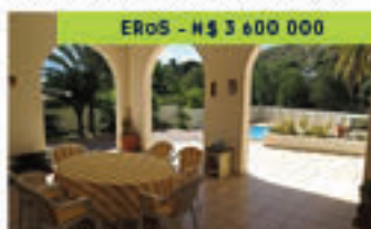
EROS - N$ 3 600 000