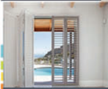
ALUMINIUM SECURITY SHUTTERS