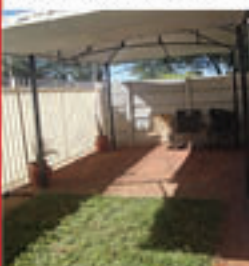
PIONIERSPARK N$ 8 000 PM

2 Bed flat with o/p kitchen, spacious living area & alcon - all on 1 level, bath with shower, toilet & wash basin. Small garden. NO PETS! Parking for 1 car. SACEW & S. Parking for 1 car. Air cond/Freezer. Available from 1 September 2018.