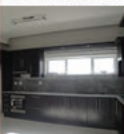
KLEINE KUPPE N$ 2.2 MIL CC

Inala Complex, Duplex townhouse with 2 Bedrooms, 2 bathrooms, very spacious open plan kitchen (lots of cupboards) with living area. Sliding doors leading onto patio with BBQ, fence in place. Tandem garage for 2 cars. Alarm system.