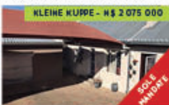
KLEINE KUPPE - N$ 2 075 000