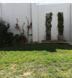
KLEINE KUPPE N$ 10 000 PM

Guldas 101 - near Gevee mall & school. Light, bright & modern north facing duplex townhouse. 2 Beds (with balconies), 1 bath, guest toilet & o/p kitchen / living room. Patio, garden & BBQ. Single garage & extra space for 1 car. PET FRIENDLY! 1 Sept 2018.