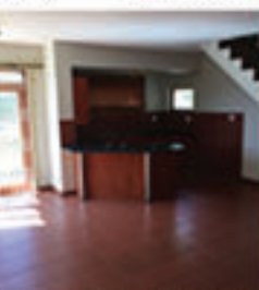
AVIS N$ 10 000 PM

Azara Complex. Fantastic mountain view. Duplex townhouse, (corner unit), 2 bedrooms, 1 full bath, guest toilet, open plan kitchen (plenty cupboards) & spacious living area. Big yard BBQ & logs. PET FRIENDLY! Single garage & extra parking. Available immediately.