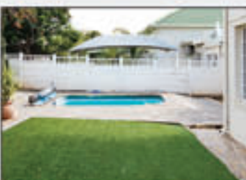
RENO PALMS, Olympia 3 Bed 2 Bath Ground Floor Townhouse (143m 2 ) N$ 2,250,000 (Levy N$2,032 pm)

Conveniently close to Westlane Shopping Center, Windhoek International School and only 10 min drive to University of Namibia (UNAM)