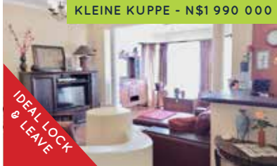
KLEINE KUPPE - N$1 990 000

www.facebook.com/RightmoveProperties www.rightmoveproperties.com.na