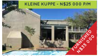
KLEINE KUPPE - N$25 000 P/M

Pet friendly for small dogs and cats. Levies N$1400. 2 beds, 2 baths. Small courtyard, 1 garage, visitors parking Tatjana 081 564 4373