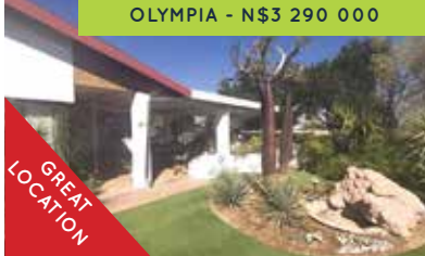
OLYMPIA - N$3 290 000