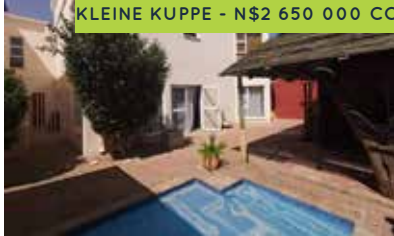
KLEINE KUPPE - N$2 650 000 CC