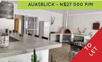
AUASBLICK - N$27 000 P/M

Or For Sale: N$4 480 000. 6 Bedroom Family House. 2 Outside Rooms with bathrooms, 4 Bedrooms with 2 Bathrooms inside the house. Spacious Open plan Kitchen & Living Room. Air-Conditioning. Large Patio with BBQ and Pizza Oven and swimming pool, low maintenance garden space. Double Garage & covered parking area, electric fencing and alarm. Available 1 Dec 19. Anita 081 124 6666