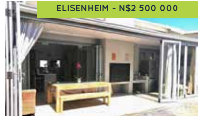
ELISENHEIM - N$2 500 000