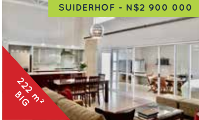
SUIDERHOF - N$2 900 000