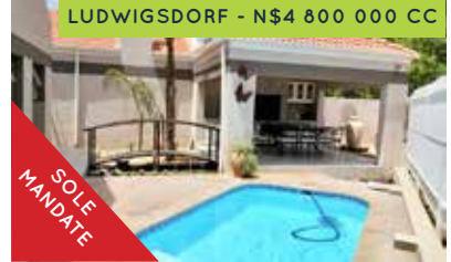
LUDWIGSDORF - N$4 800 000 CC