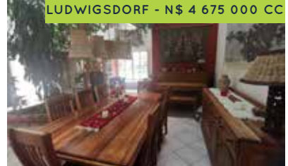
LUDWIGSDORF - N$ 4 675 000 CC