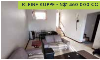
KLEINE KUPPE - N$1 460 000 CC