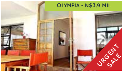
OLYMPIA - N$3.9 MIL

3 Bedrooms, 2 Bathrooms. Huge Living/ Dining area. Open plan Kitchen with Scullery. Indoor Entertainment with Bbq and stack up doors. 4 X Aircons. Swimming pool. Erf 450m 2 . Anita 081 124 6666